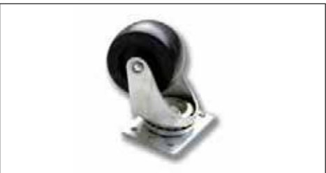
Roll into position Castors (option)