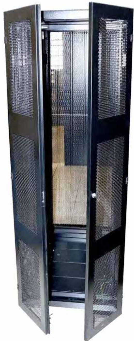
Saloon type rear doors