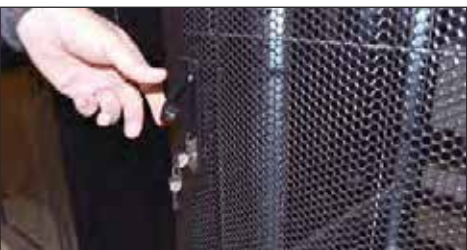
Swing Lever Locking