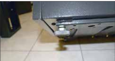
H/D Load bearing levelling feet