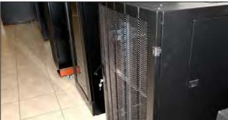
Curved mesh door 80% air flow